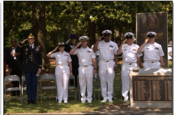
The official party renders salutes during the playing of Taps.