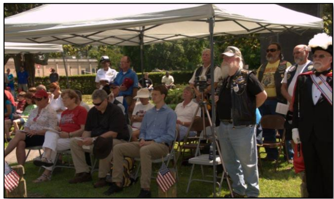
USS Scorpion family members and guests observe the ceremony.