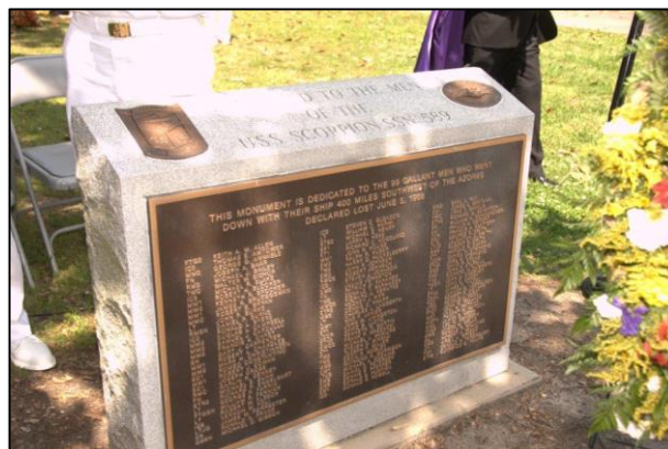
USS Scorpion Monument in Huntington Park – Newport News, VA